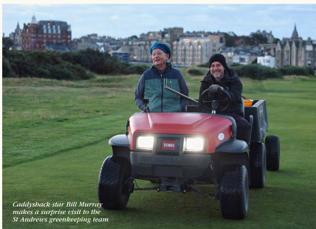
Caddysback star Bill Murray makes a surprise visit to the St Andrews greenkeeping team