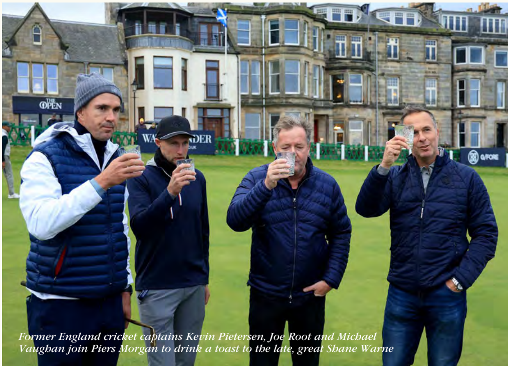
Former England cricket captains Kevin Pietersen, Joe Root and Michael Vaughan join Piers Morgan to drink a toast to the late, great Shane Warne